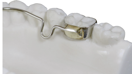
Hydro Flame Soldering

Soldering material is composed of silver, copper, zinc and tin which have different melting points which can cause porosity in the solder joint and will discolor over time.